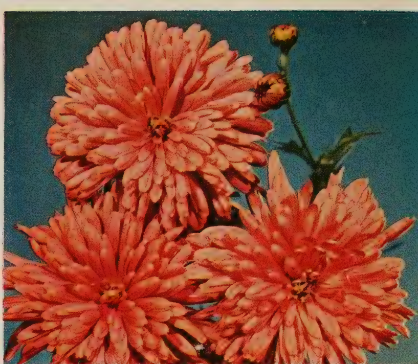
TRIBUTE. 60c each; 3 for $1.50